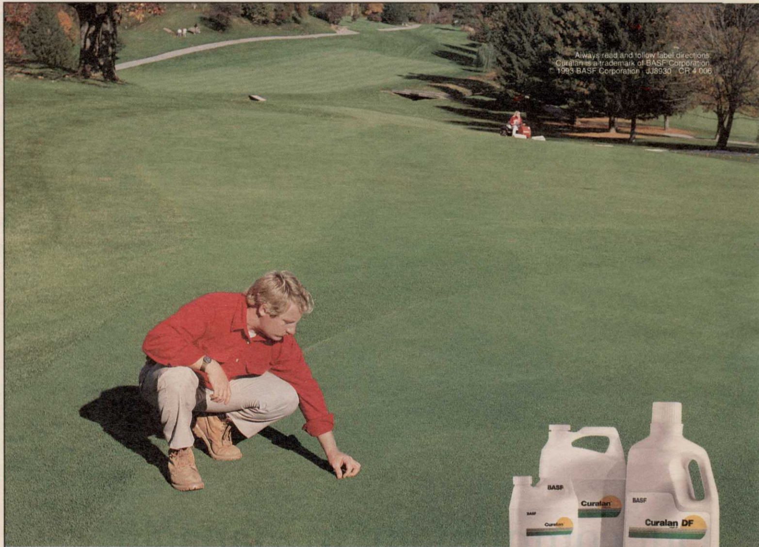
Always read and follow label directions. Curalan is a trademark of BASF Corporation. © 1993 BASF Corporation. JJ8930 CR 4 006

These are just a few of the interesting questions that university scientists will attempt to answer during the next five years. It is important to remember that the answers will be based on thorough, side-by-side comparisons of a wide range of construction, grow-in, and post-grow-in regimes. The research will provide more sound, scientific information upon which the putting green construction and maintenance debate can be based.