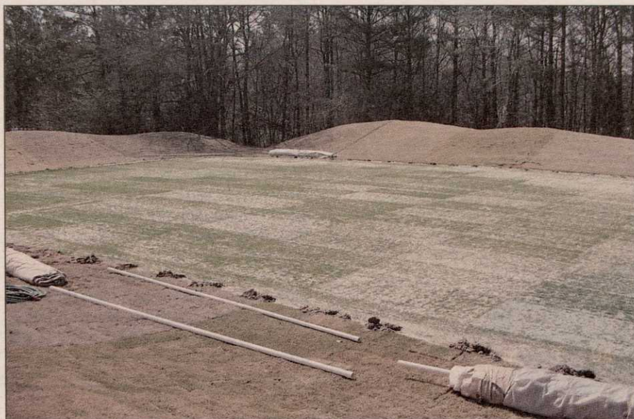
The dead-air green at Atlanta Athletic Club is divided into 5-by-10-foot plots for 28 cultivars and five blends of turfgrass.