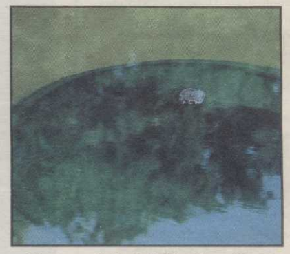
Ottershield Lake Dye