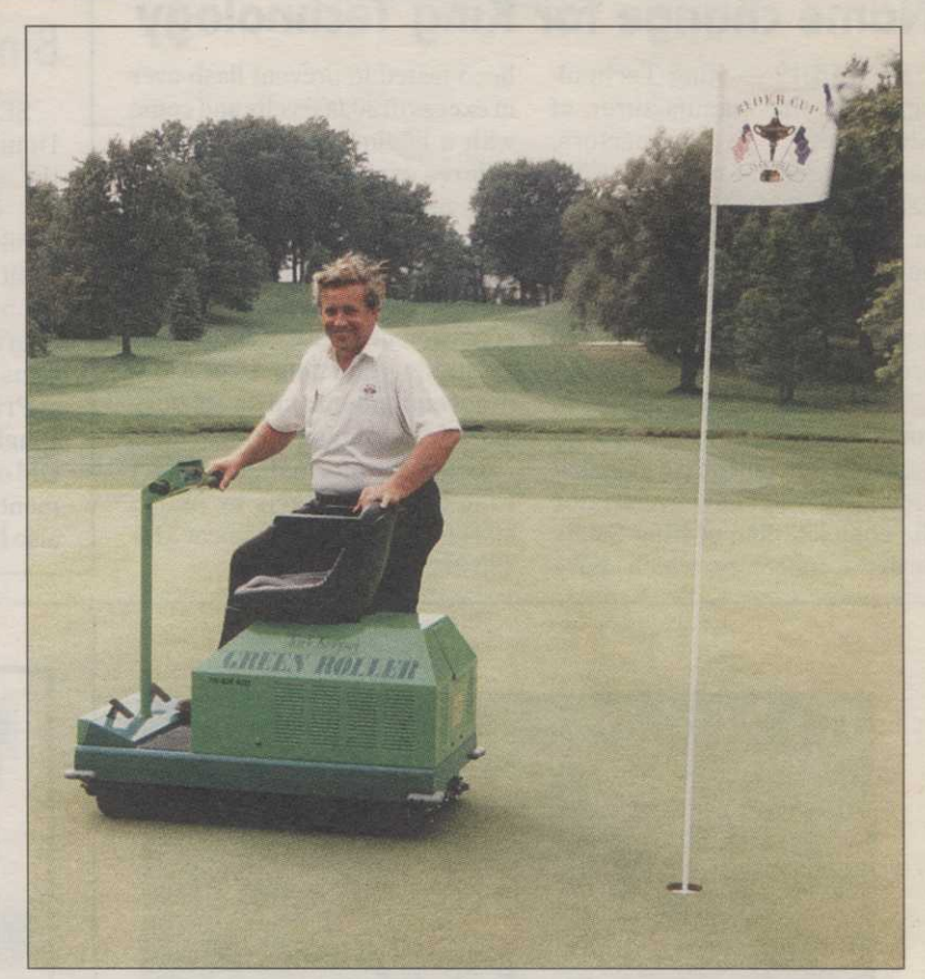
ELECTRIC, BUT CORDLESS

The first and only battery-operated greens roller has been developed, premiering at Oak Hill Country Club in Rochester, N.Y., which staged the recent Ryder Cup. Distributed by Turf Keeper, the electric model is automatic and will roll 18 holes of golf on a single charge. It comes complete with its own transport trailer and charger. More information is available from Bill Stinson at Turf Keeper by calling 716-624-4221, or faxing 716-624-5340. For more new products, turn to page 50.