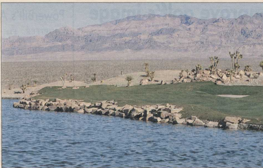
The 17th hole at the Pete Dye-designed Nu-Wav Kaiv Course located on the outskirts of Las Vegas.

MEMPHIS, Tenn. — The city's park commission will decide in the next 90 days which of three nationally-known golf course designers will design a new $6 million municipal golf course at Riverside-Martin Luther King Park. Either Tom Fazio, Rees Jones or Jack Nicklaus will be awarded a project which calls for replacing the current nine-hole course with an 18-hole layout. The project also includes a clubhouse and driving range. The course could be ready for play by 1997.