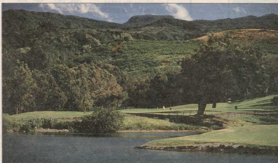
The Village Course is one of three at Kapalua now involved in the Audubon Heritage Program.

"We have a lot of golf courses at resort facilities," Dodson said. "But it seemed if you have people spending days and weeks, it would be great to take a whole resort property and develop a program that would essentially use our sustainability principles — the approach we use for Signature facilities — but also develop a cultural and environmental