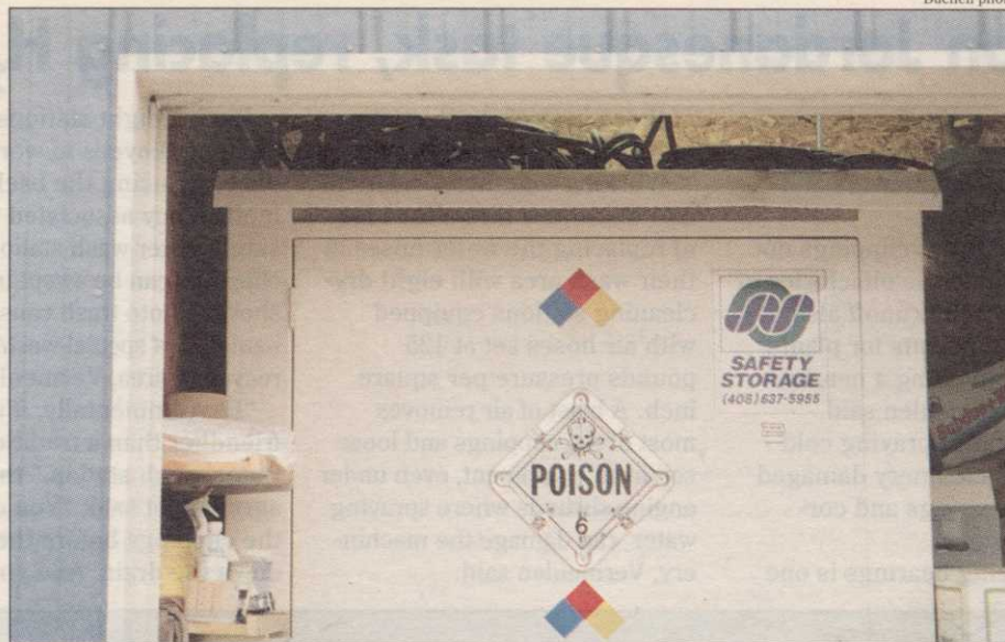
The pre-fabricated pesticide storage building at Double Eagle sits inside another structure.

Laws vary from state to state. Although it may change soon, in Ohio we are not yet required to have a separate pesticide