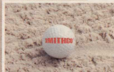
SMOOTH, FIRM FINISH... NOT SOFT

The quiet and efficiency of electric power comes to sand bunker maintenance... with clean, pollution-free operation... minimum of maintenance... low cost... and a new and exclusive, silent clicker sand rake system... without the many problems of engine noise, emissions, fluids and interruption of play. You must see... and hear(?)... Sand Star E.