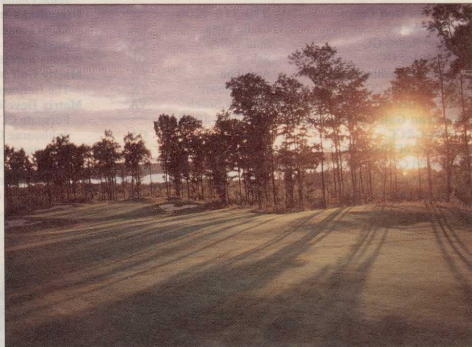
Shanty Creek Golf Course has successfully catered to the corporate incentive travel market.