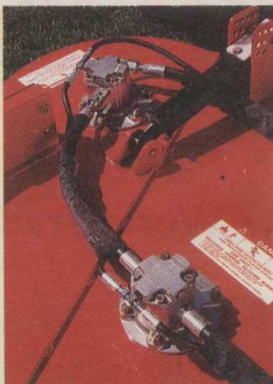
Individual hydraulic motors drive each blade for unmatched cutting power and reduced maintenance.

A full 11' cut and 51 horses of liquid-cooled diesel power let