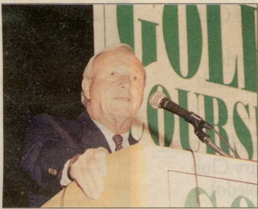
PALMER KICKS OFF EXPO

One step back? Golf races ahead on Mississippi coast but suffers a blow in Jacksonville ..... 35