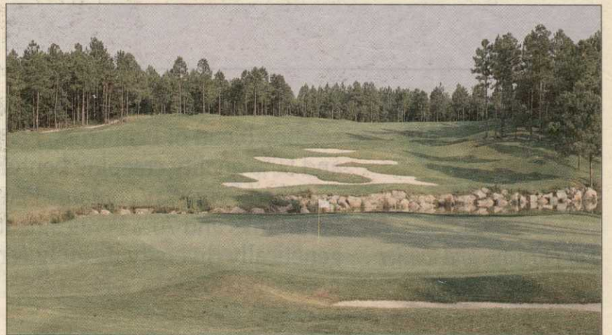
Pinehurst Plantation is one of the private clubs in the Golf Communities USA portfolio.