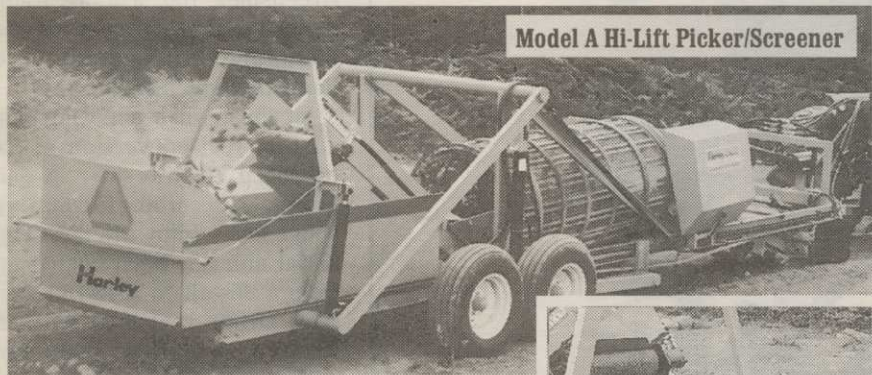
Model A Hi-Lift Picker/Screening

Plus: Get the best shaping, leveling and seedbed prep in the industry!