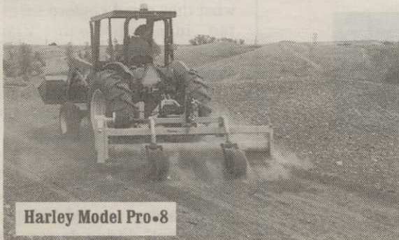
Harley Model Pro-8

Rake and windrow rocks, roots, stones, and trash with any of 3 sizes of Harley rakes.