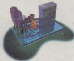
LIT 006A, 1-95