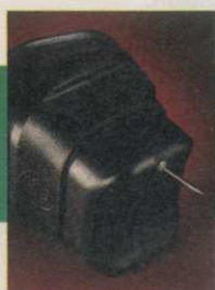
For ground mounting, install spike using double nuts or...