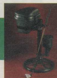
A Divot Mate Ensemble. Perfect for Par 3's or Driving Ranges.