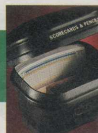
Perfect for keeping score cards and pencils available and dry.