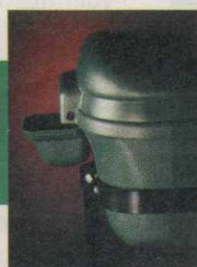
Convenient Broken Tee container — Divot Mate is two products in one.