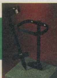
...Use optional 20" stand made from tough anodised aluminum.