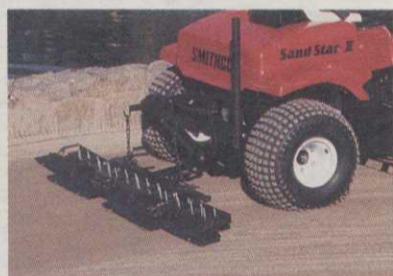
TWIN - PHASE RAKING SYSTEM