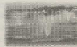
Plume - 5 HP