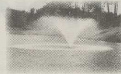
Standard High Volume Flow (HVF) - 1 HP