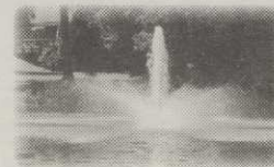
Crown & Geyser - 2 HP

Aqua Master is the industry's only manufacturer of UL LISTED aerating fountain pump systems. Take a closer look at our beautiful solution to your water quality problems.