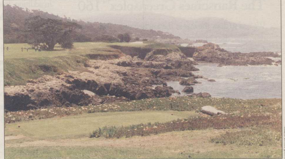
Cypress Point Golf Club, on California's Monterey Peninsula, has the perfect climate for Poa annua.

"These perennial Poas will have improved color, texture, and vigor" when compared to naturalized varieties, White said, adding he hopes they will outperform bentgrass in areas where Poa annua thrives.