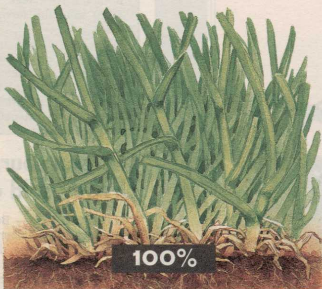
Banner & ProStar® tank mix, 1994, Vail, Colorado. Pink snow mold control.