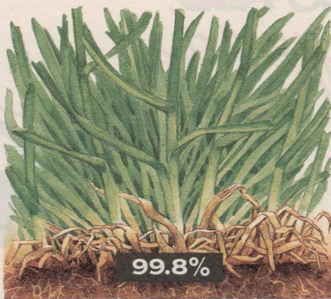
Banner & PCNB tank mix, 1994/95, Michigan State University. Pink snow mold control.