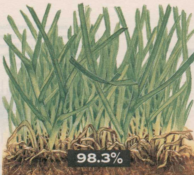
Banner & Daconil® tank mix, 1994/95, Michigan State University. Pink and gray snow mold control.