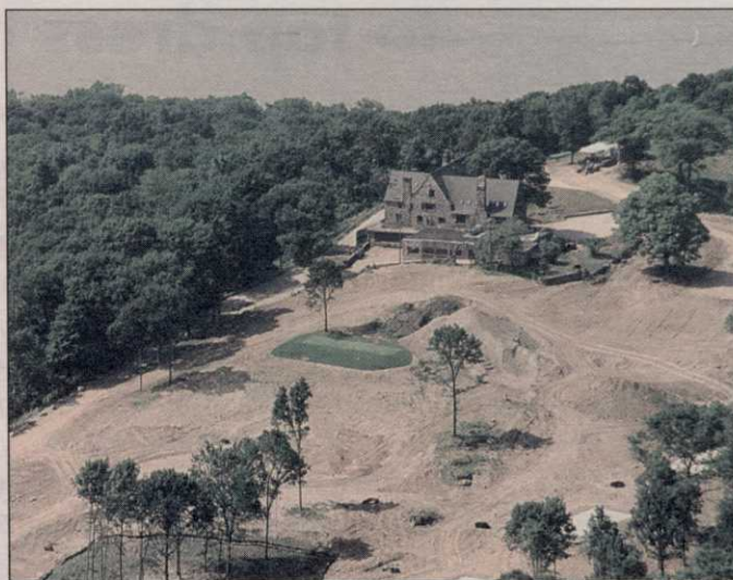
Hudson National Golf Club is one of National Fairways' 14 facilities.