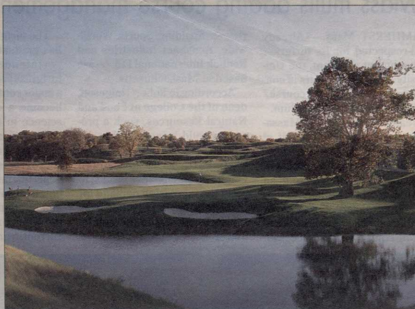
Cooks Creek Golf Club is aggressively marketing to the Columbus, Ohio, daily-fee market.