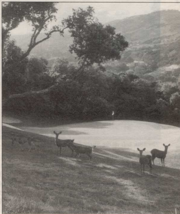
The impact of golf courses on deer and other wildlife is the subject of more intense study.

USGA-backed Wildlife Links using a more broad-brush approach