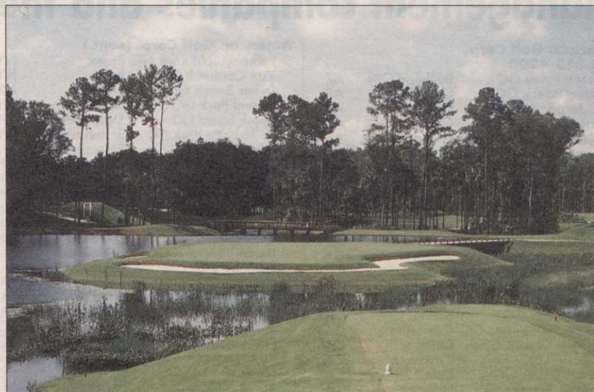
Alaqua Country Club near Orlando is the most recent addition to the Signature portfolio