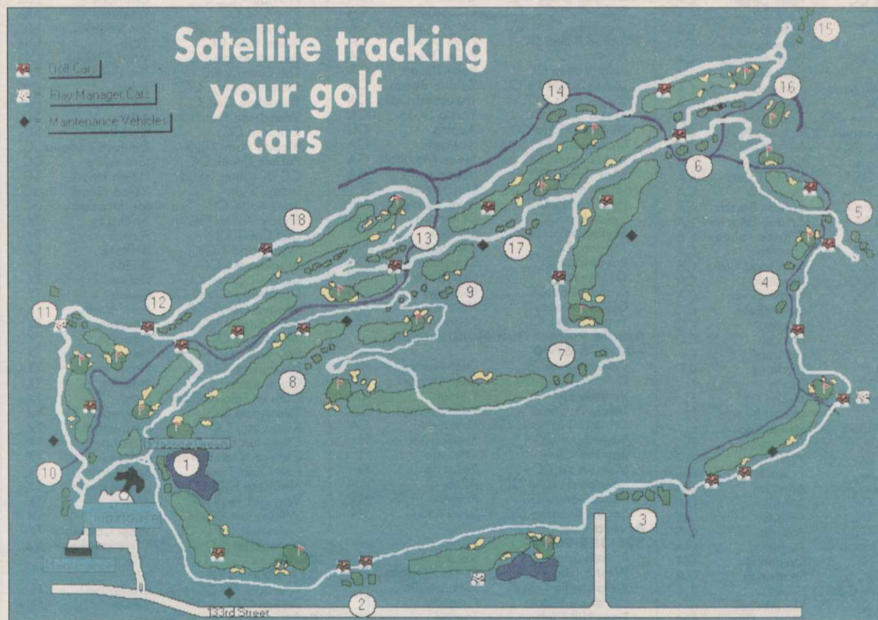
A new satellite-based tracking system allows golf course managers to continually monitor the locations of all course vehicles.