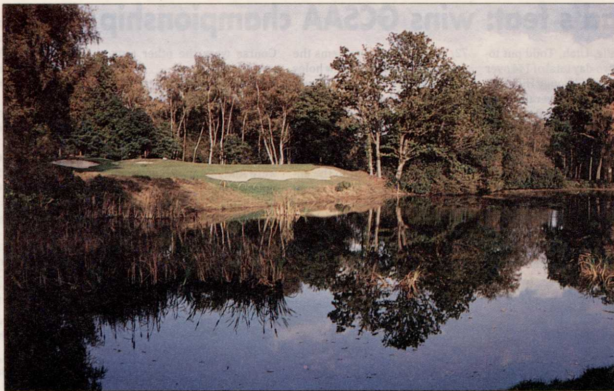
A shimmering, goose-free hazard guards the 17th green on the Edinburgh Course, a new addition to the Wentworth Club in Virginia Water, England. The Edinburgh is a John Jacobs Golf Associates design.