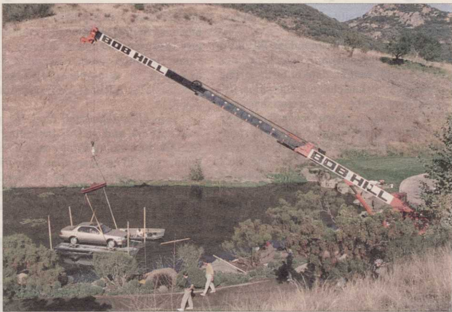
A crane, with a sling attached, lowers the floating raft and car all at once into the water.

"The local Chrysler distributor in Indio brings out the cars," King explained. "They have a rectangular float-type raft with pontoons that are literally filled with air from a portable, gasoline-powered air compressor. We bring the raft to the edge of the lake, put out same ramps, drive the car out onto the pontoon raft, and float it out into position. We then release the air so the autos tires are lowered two to three inches into the water to make them look like they're floating on the water. The raft is tied down with wires and boat anchors so it will stay in position during almost any type of weather."