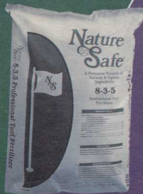
Also available in 10-2-8, 10-3-3, and 7-1-14