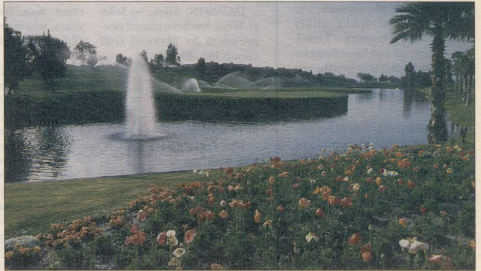
Mission Hills South in Palm Springs, Calif., is one of 28 courses in the Golf Enterprises portfolio