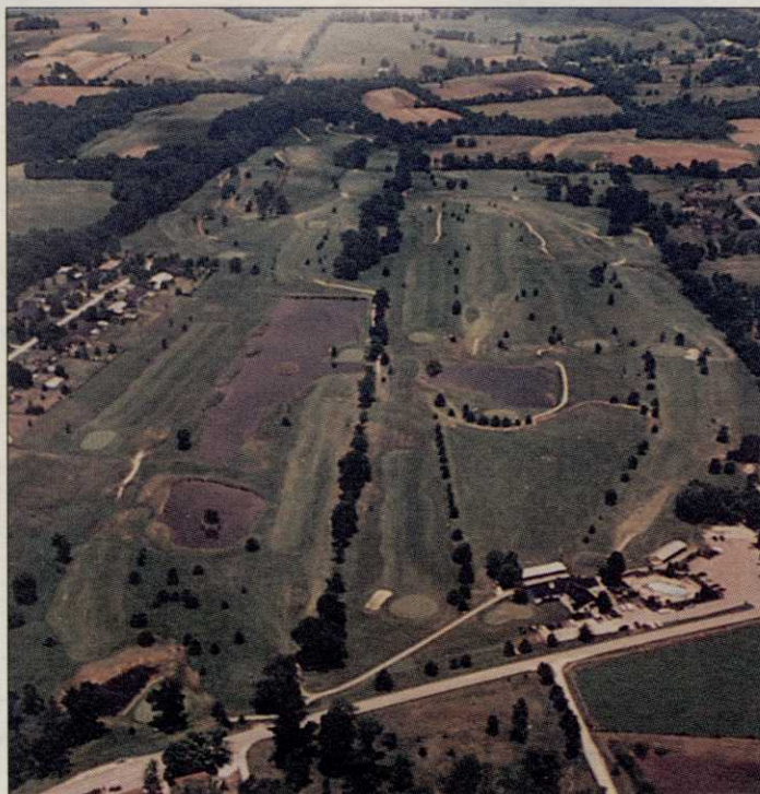
Course as doorprize? Bob O'Link Golf Club, located in Lawrenceburg, Ky., is there for the taking. The 145-yard, par-3 8th spans the small pond at right.