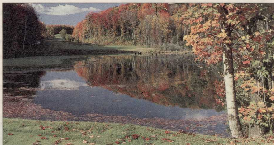
Treetops Sylvan Resort, Gaylord, Michigan