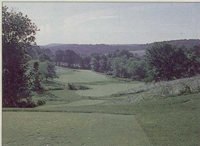
The 6th hole at the Tom Doak-designed StoneWall Country Club outside Philadelphia, which measures 446 yards from the back and 347 yards from the forward tees. The no-carts-allowed, par-70 course measures 6,300 to 6,700 yards.