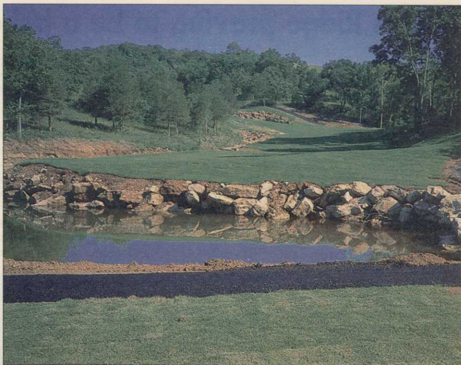
A view of LedgeStone Golf Course's 16th green viewed from the 17th tee. The par-4, 392-yard 16th, nicknamed The Big Chill, features a sharp dogleg right — and Kenny Rogers' new home on the hill.