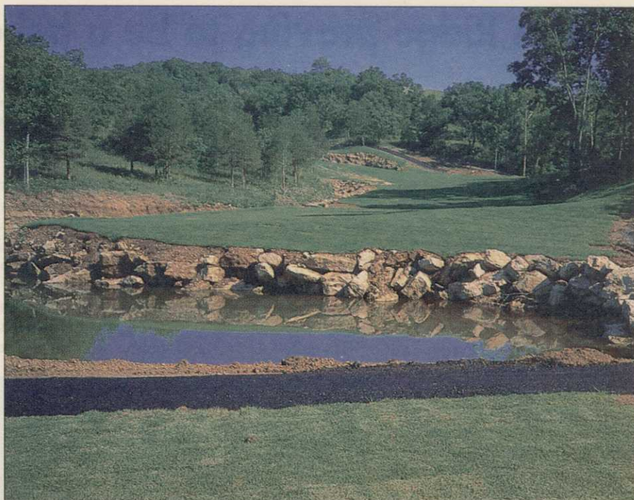
A view of LedgeStone Golf Course's 16th green viewed from the 17th tee. The par-4, 392-yard 16th, nicknamed The Big Chill, features a sharp dogleg right — and Kenny Rogers' new home on the hill.