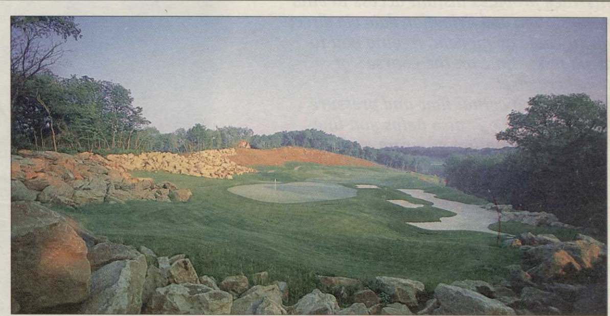
DIAMOND IN THE ROUGH?

"Water thus treated is very low in carbon and is Continued on page 23