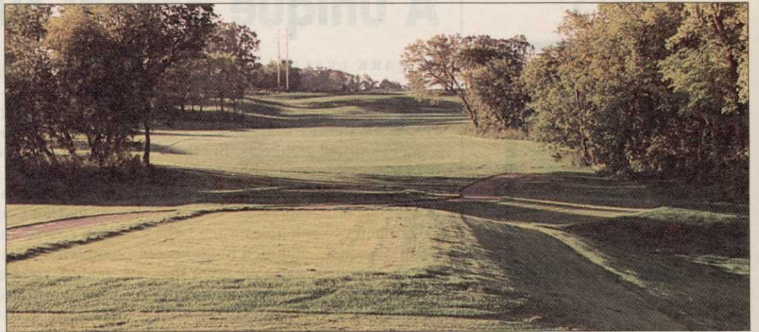
The 335-yard, par-4 16th hole at Crystal Lake Golf Club in Lakeville, Minn., designed by Williams, Gill & Associates of River Falls, Wis.