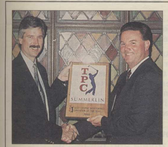
TPC SUPERINTENDENT OF THE YEAR

Golf Asia '94 is history. Architects are busy (page 42) but questions about the show's future remain .......59