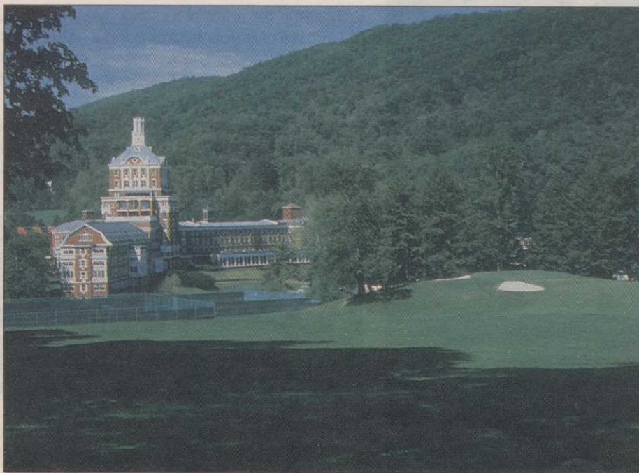
Club Resorts is undertaking extensive renovations at The Homestead

LinksCorp is owned by management and three venture capital firms — Batterson, Johnson & Wang; William Blair Venture Partners; and Northwest Venture Capital.