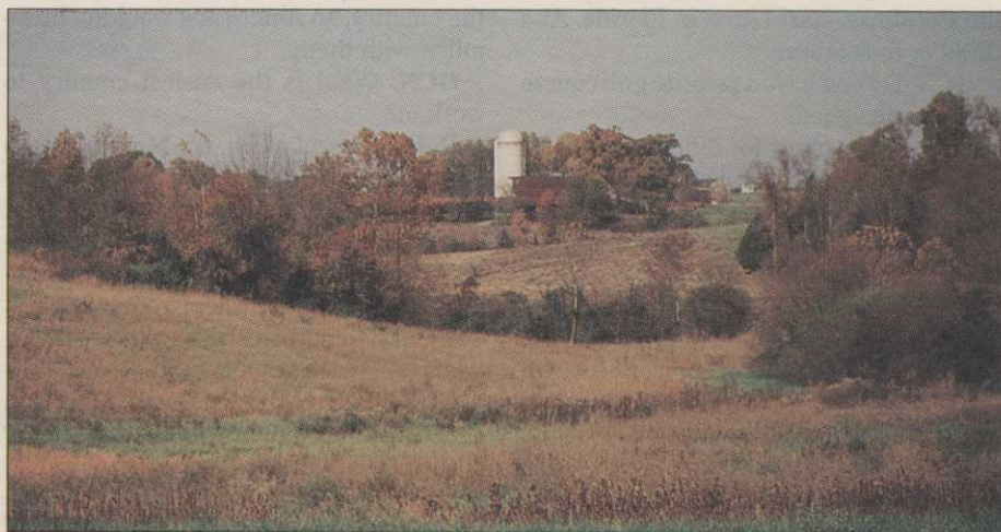
Future site of Oak Valley Golf Club, an Arnold Palmer design to be managed by the Carolinas Golf Group

MURRIETA, Calif. — The Southern California Golf Association has renamed the Rancho California Golf Course it purchased this winter from the SCGA Members Club at Rancho California.