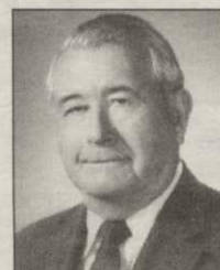
Dr. James Watson