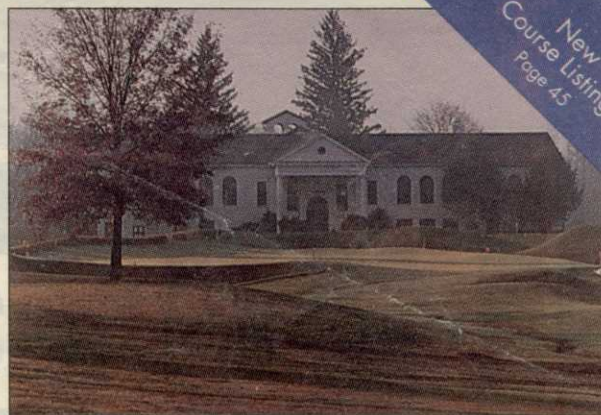
The stately 18th at Minisceongo Golf Club in Rockland, N.Y. This Roy Case design opens in June.