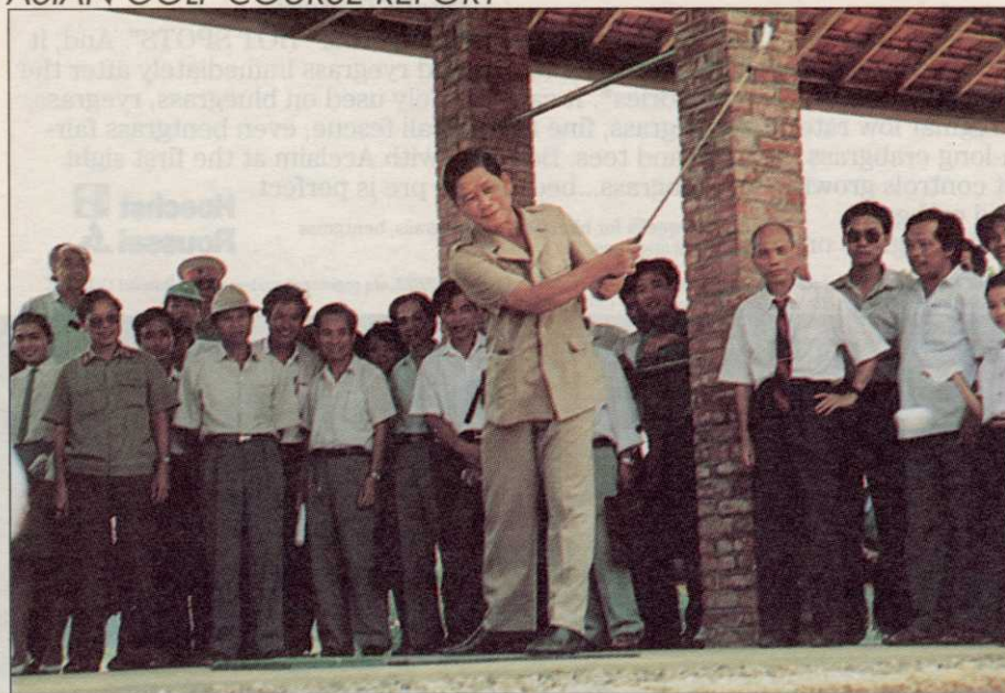
Vietnam Vice Premier Nguyen Khanh christens the country's first driving range, at King's Island Golf Resort on Lake Dong Mo, outside Hanoi.