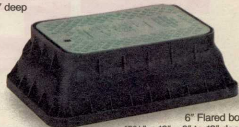
6" Flared box 10 3/4" x 16" x 6" to 18" deep