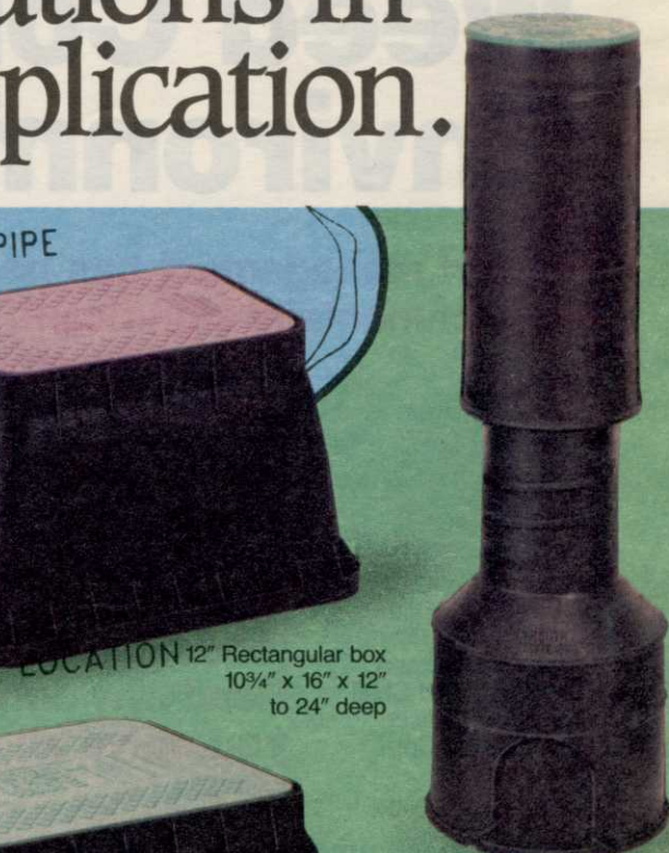
Polyiron box 7 5/16" diameter x 29 1/2" to 64 1/2" deep

For specifications on the complete line of irrigation valve boxes and the location of your nearest dealer, contact AMETEK, Plymouth Products Division, P.O. Box 1047, Sheboygan, WI 53082-1047. Tel: 800-222-7558. (In WI, 414-457-9435). Fax: 414-457-6652.