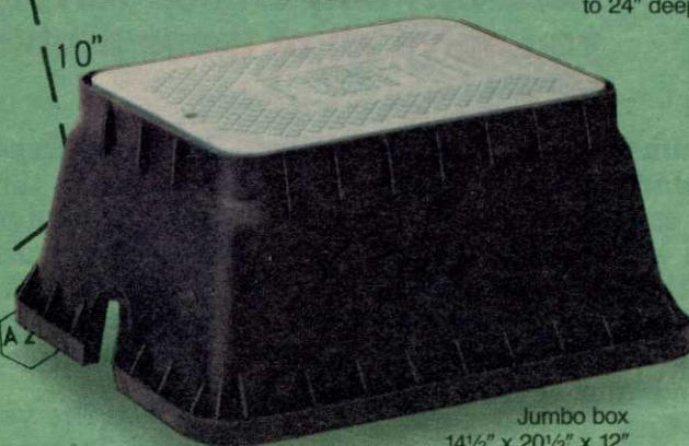
Jumbo box 14 1/2" x 20 1/2" x 12" to 18" deep