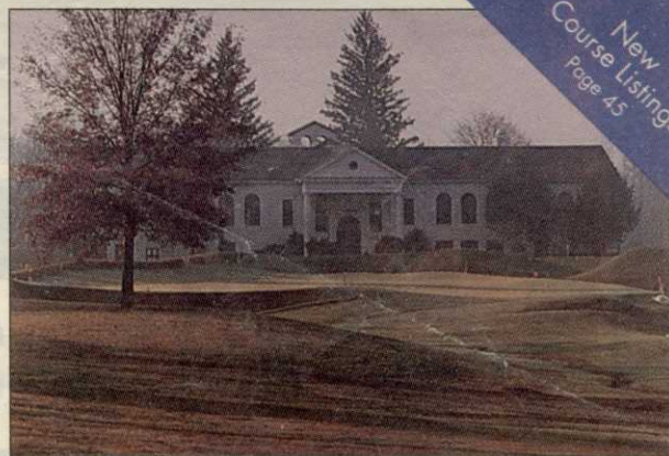
The stately 18th at Minisceongo Golf Club in Rockland, N.Y. This Roy Case design opens in June.