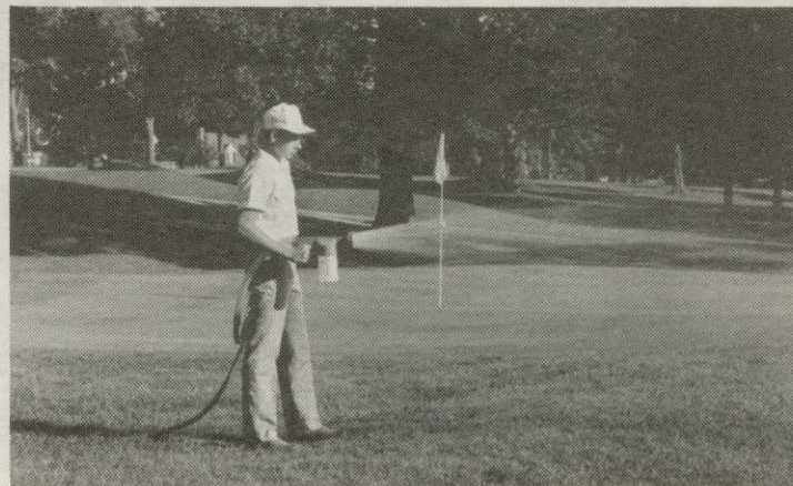
Convenient, cost-effective Pro-Ap delivers consistent, measured quantities of Hydro-Wet RTA—treats 1,000 sq. ft. in less than one minute.

For more information on the Pro-Ap application system, circle the number below, or call Kalo, Inc., toll-free: 1-800-255-5196.