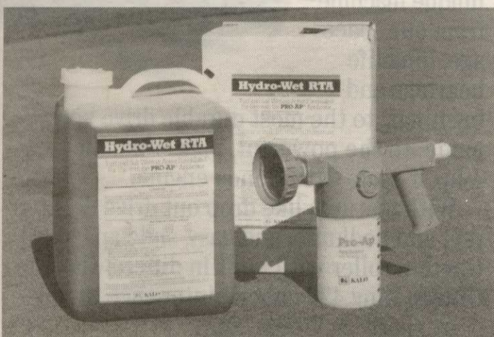
Hydro-Wet RTA is the proven turf wetting agent formulated for application with the Pro-Ap hose-end applicator.