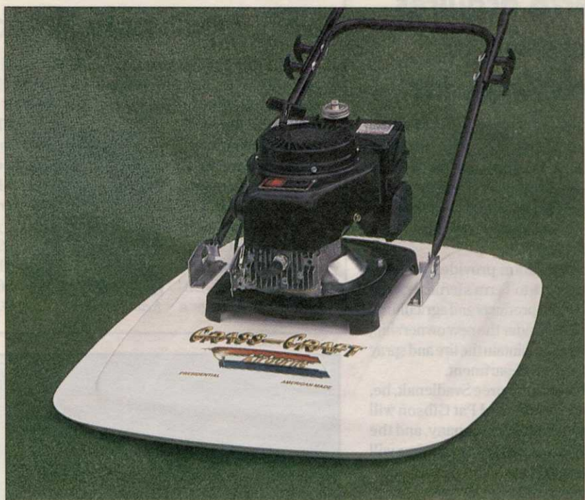
The new Airborne hover mower from Grass Craft.