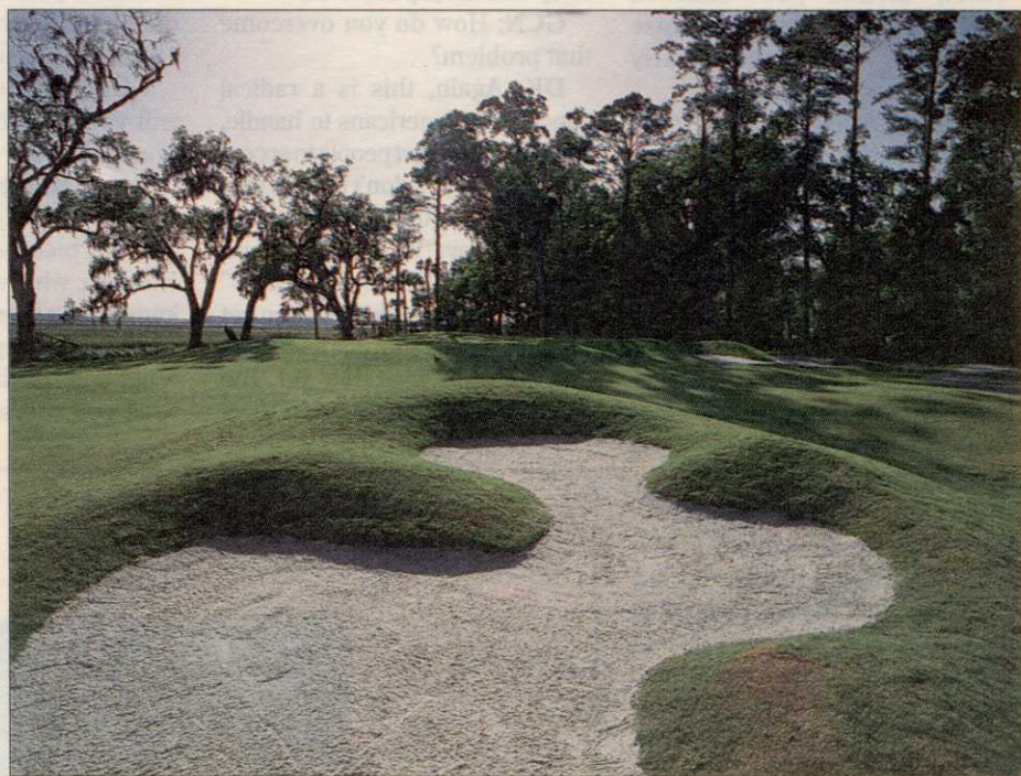
Oak Grove Island Golf Club's bunkering shows the handiwork of designer Mike Young.

with a residential community offering more than 500 building sites with waterfront, marsh or golf course views. Accessible by boat or causeway, it also features a full-service deep water marina.