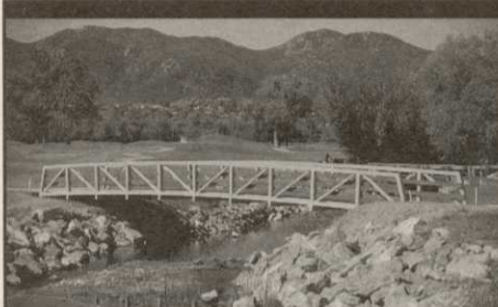
Carlton Oaks Country Club, Santee, CA 10' wide x 60' long, 10,000 lb. capacity

Golf Course Bridges are our specialty! We fabricate easy-to-install, pre-engineered spans and deliver them anywhere in the USA. Call today for a free consultation.