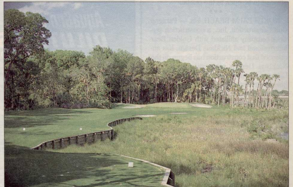
Queens Harbour Yacht & Country Club in Jacksonville is one of 33 courses participating in the First Coast golf and hospitality cooperative.

First Coast course and hotel operators long suspected they were being bypassed