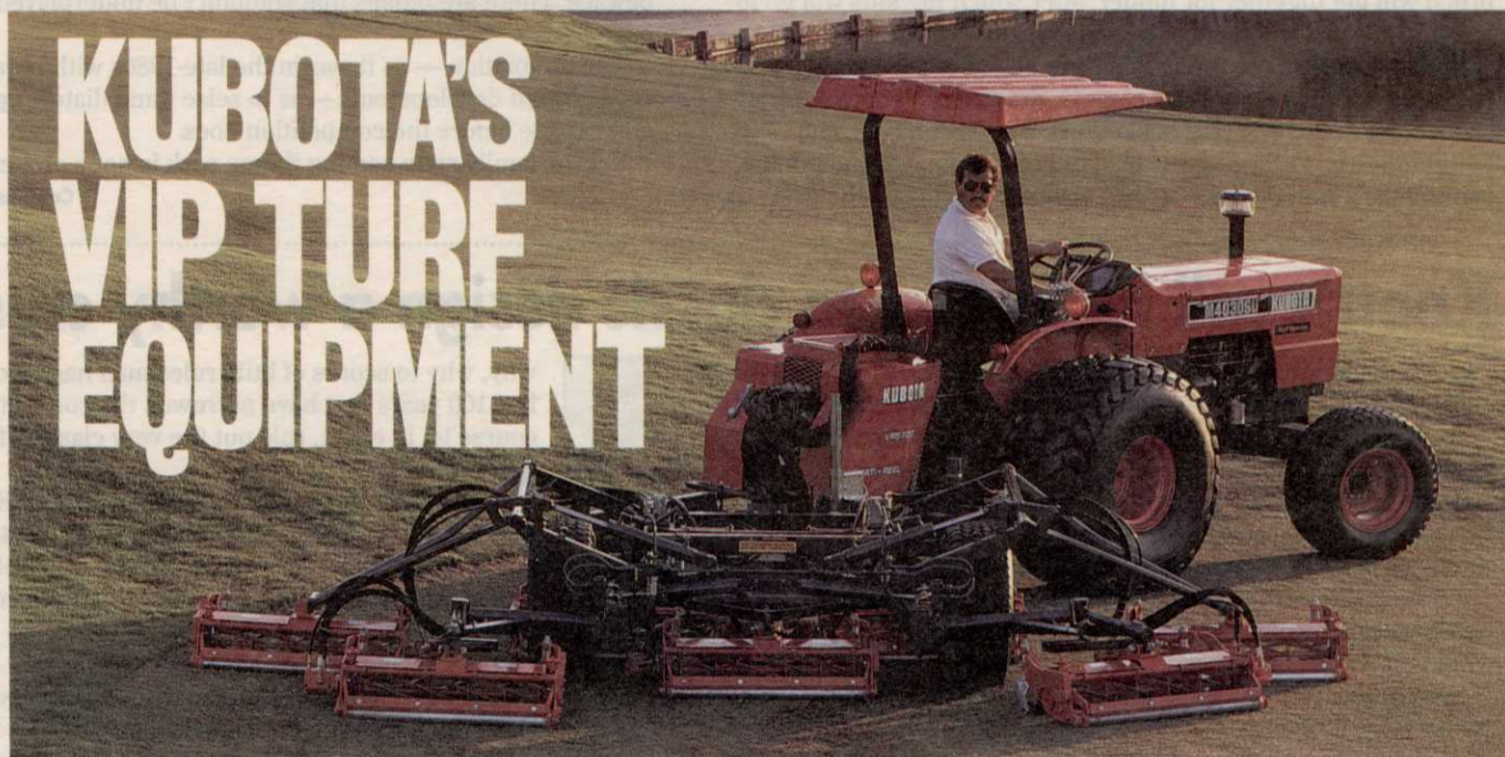
M4030SU with 5-gang Verti-Reel for high production mowing.