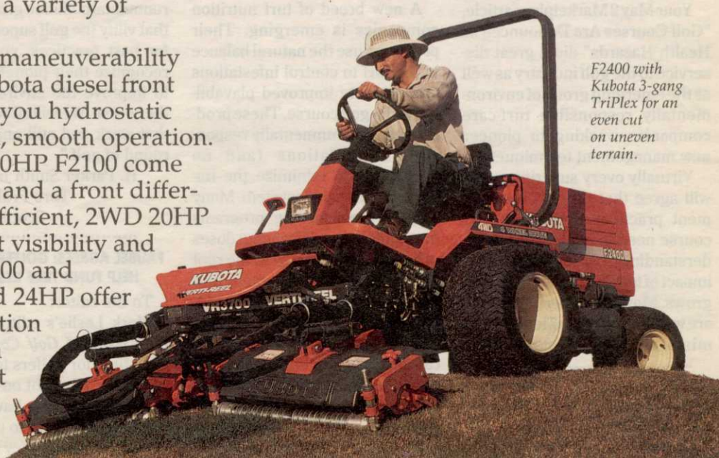
F2400 with Kubota 3-gang TriPlex for an even cut on uneven terrain.

KUBOTA TRACTOR CORPORATION P.O. Box 2992, Dept. GCN, Torrance, CA 90509-2992 Financing available through Kubota Credit Corporation