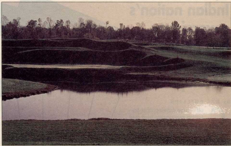
A view of the 8th green at Lassing Pointe.

Jamestown, ND 58402 1-800-437-9779 / FAX 701-252-1978