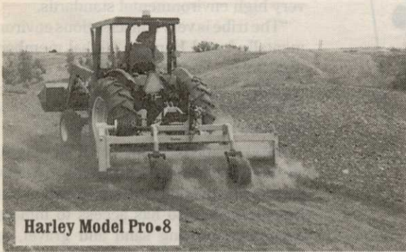
Harley Model Pro-8

Rake and windrow rocks, roots, stones, and trash with any of 3 sizes of Harley rakes.