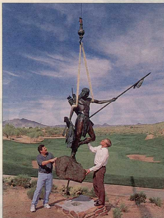
RECOGNIZING THE APACHE SPIRIT