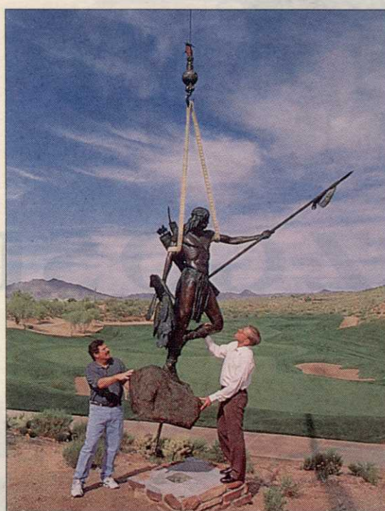
RECOGNIZING THE APACHE SPIRIT