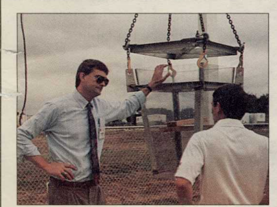
ENVIROTRON ON LINE

USGA agronomists weigh in with research data and GCN explores issues surrounding public golf .... 41,78