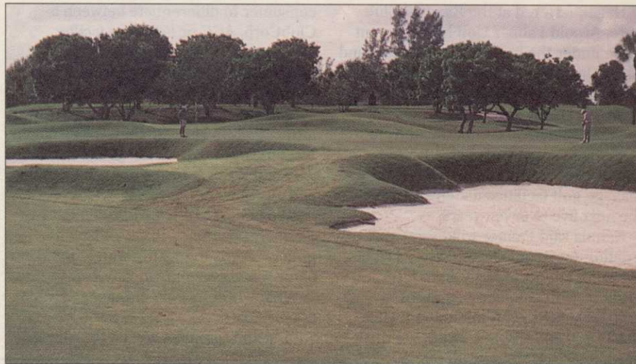
Deer Creek reopened in November after a six-month, $3 million renovation.

gust, the Boca Raton Resort and Club will operate the clubhouse facilities and all food and beverage operations at both golf clubs, including the restaurants, lounges, outdoor cafes and meeting and banquet facilities.