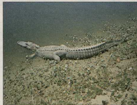
An alligator patrols Kiawah's Ocean Course. The creature became famous during the '91 Ryder Cup.