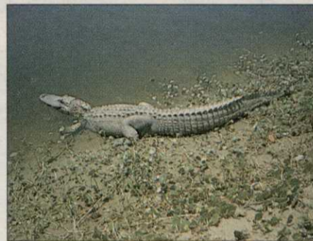
An alligator patrols Kiawah's Ocean Course. The creature became famous during the '91 Ryder Cup.