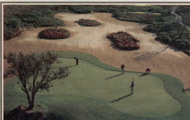
Redhawk Golf Club, Temecula, California, Hole #12, 168 yard, Par 3