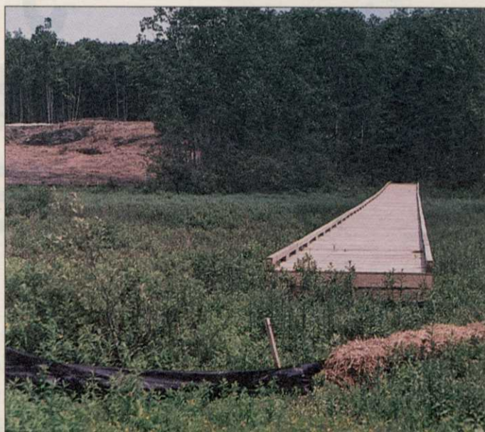
Wetlands and endangered species face changes in the minds of the lawmakers. This footbridge is typical of those bridging wetlands these days.

Pro-business interests mobilizing against the new rules — which are being pushed in Senate bill S.191 by Sen. Max Baucus (D-Montana) — say the changes will make it more difficult for regulators to