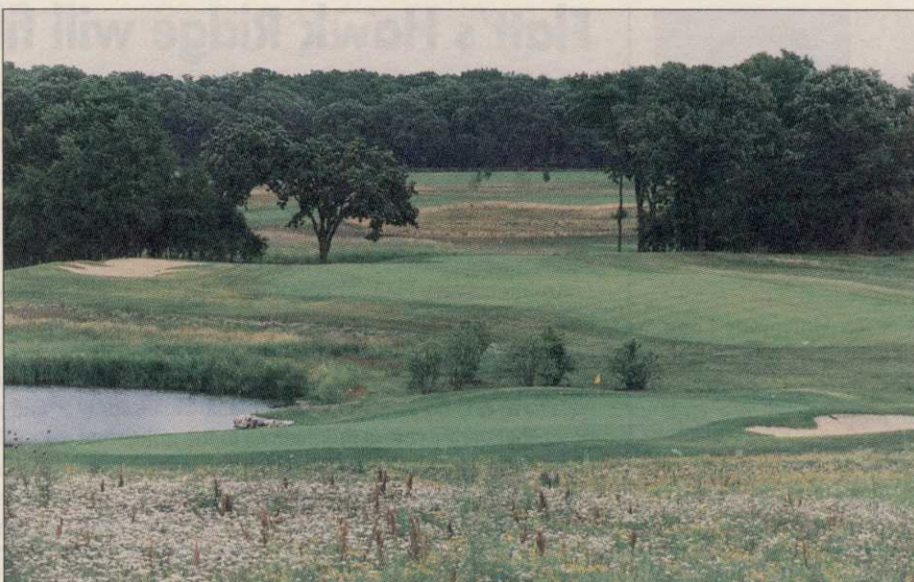
Merit Club sets an example as open space in preservation program.

establish the easement in 1991. Details of the arrangement were finalized this fall.